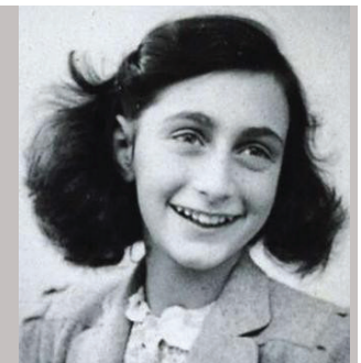
Anne Frank's family sought refuge in the U.S. but restrictive American immigration policies kept them out. She died in the Bergen-Belsen concentration camp in 1945.